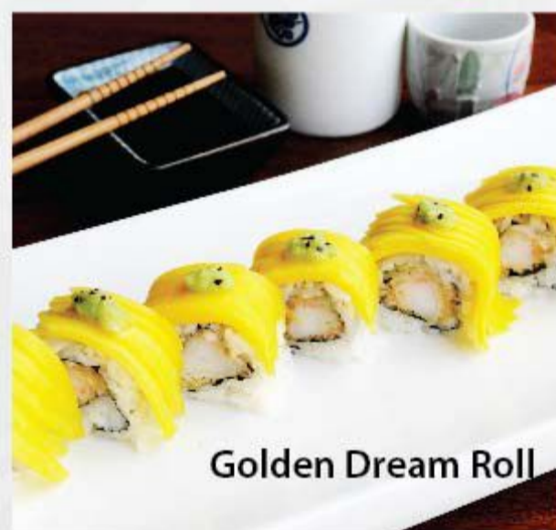
Golden Dream Roll