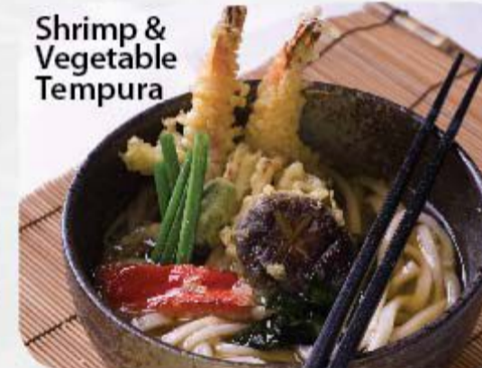
Shrimp & Vegetable Tempura