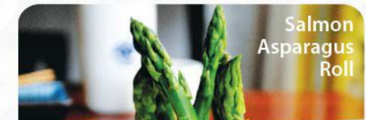
Salmon Asparagus Roll