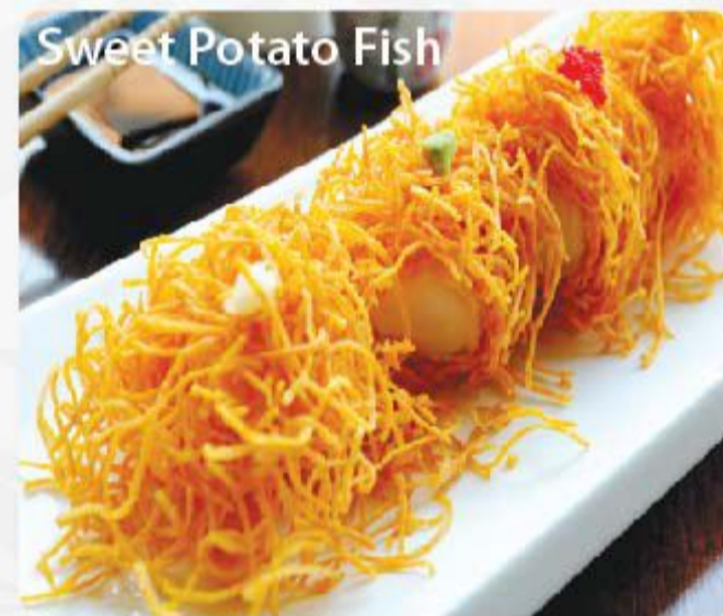
Sweet Potato Fish