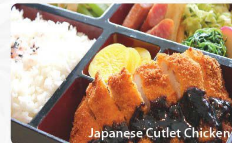
Japanese Cutlet Chicken