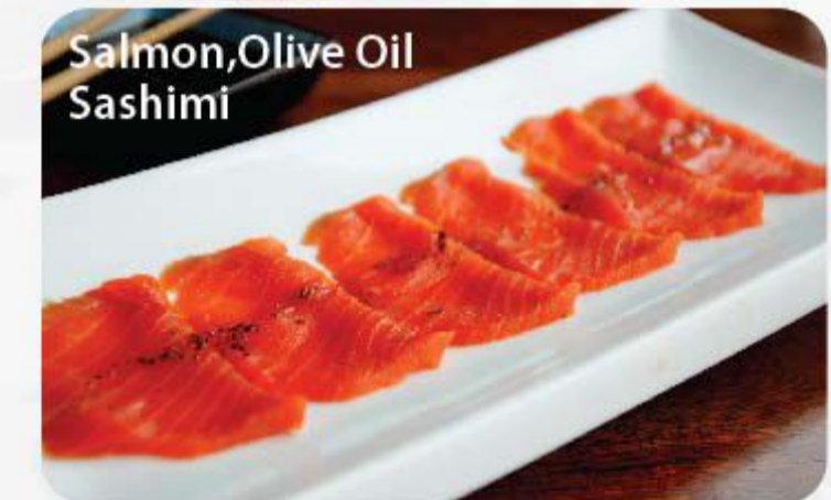
Salmon, Olive Oil Sashimi