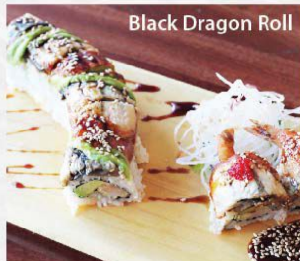
Black Dragon Roll