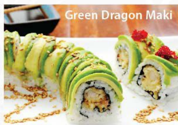
Green Dragon Maki