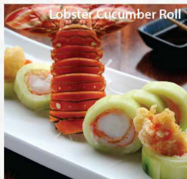
Lobster Cucumber Roll